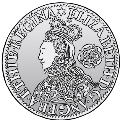
Queen Elizabeth I silver sixpence 1561

On 10 July 1561, Queen Elizabeth I made a special visit to the Royal Mint at the Tower of London. She came to see the workers busy minting her new Elizabethan coins made of silver and gold. This new money was needed to replace the poor quality coins in use at the time, which contained very little precious metal.