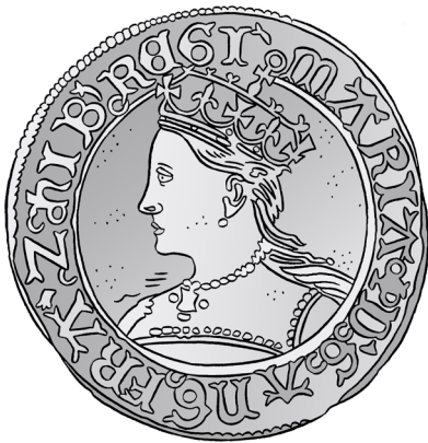
Queen Mary I silver groat 1553

Over 450 years ago, the Royal Mint at the Tower of London produced new silver coins for the five-year reign of Queen Mary. This silver groat was worth four pence and Mint workers struck these coins by hand. These 'moniers' used hammers and special coining tools called dies to strike designs into silver 'blanks', which were cut and shaped by hand. This is why these coins are uneven shapes and not perfectly round.