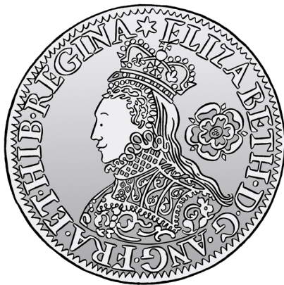
Queen Elizabeth I silver sixpence 1561

I hereby command the Royal Mint to collect and melt down England's worthless coins of old. All new coins bearing my portrait shall be minted in precious silver or gold, so that England's currency is valued and trusted once more.