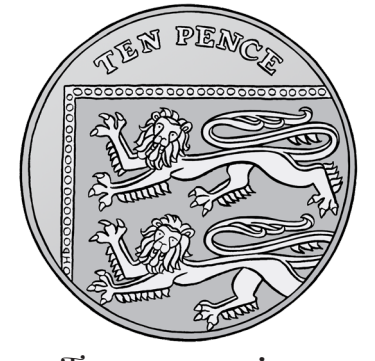
Ten pence coin - reverse side